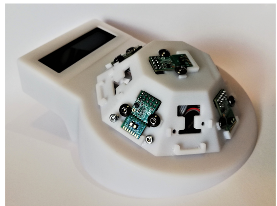
Figure 3: Final prototype.

to observe the participant's behaviour and experience when using the device by the first time. The data obtained was used to draw the conclusions of this thesis. It was possible to verify that the implemented gestures were intuitive for the users. They were able to learn how to use the device in a fairly short time. Most of the errors detected while the users were performing the tasks could be easily prevented if they gain more experience using the device. Besides that, from the observations and the participants' suggestions, it was possible to define the fundamental aspects that needed to be improved. The prototype was modified by adding more functionalities and a more ergonomic case. The final prototype is presented in Figure 3.